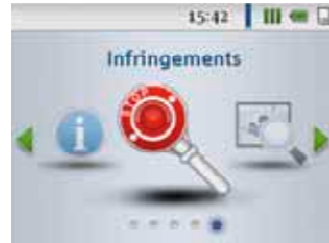
On-site infringement monitoring

Order no. for DLK Pro Neoprene Case: A2C59514917