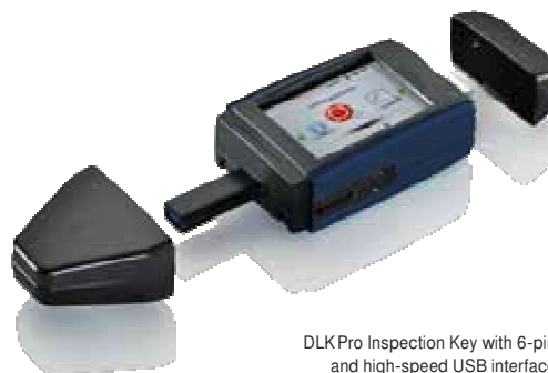
DLK Pro Inspection Key with 6-pin and high-speed USB interface