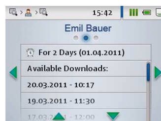
Detailed view of existing and due downloads