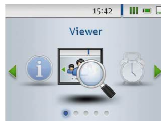
View data on the Key

Order no. for DLK Pro TIS-Compact Neoprene Case: A2C59514917