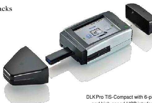
DLK Pro TIS-Compact with 6-pin and high-speed USB interface